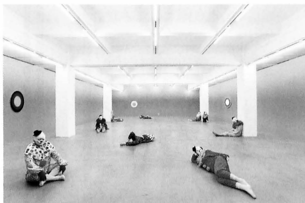
Cover: Design by Ugo Rondinone for Art in America , 2014, crayon on paper, 5¾ by 4¾ inches. Above, view of Rondinone's exhibition "Breathe Walk Die," 2014-15, at the Rockbund Art Museum, Shanghai. See Contributors page.

As she prepares to represent Switzerland at the Venice Biennale this spring, the artist speculates on the science of cat pheromones, evolutionary theory and mineral-water marketing strategies.