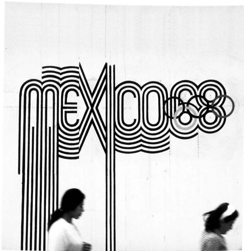
page 90 Wall mural featuring a design by Pedro Ramírez Vázquez and Eduardo Terrazas for the 1968 Summer Olympics in Mexico City