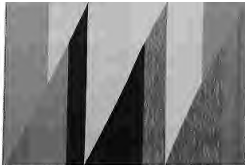
Heft, Elad Hassry: Untitled (Carpet, Sea Spider) , 2019, gelabt In silver Sprint ans offset print Bon Kaper In wainut Frame, DPA by 141/2 inches.